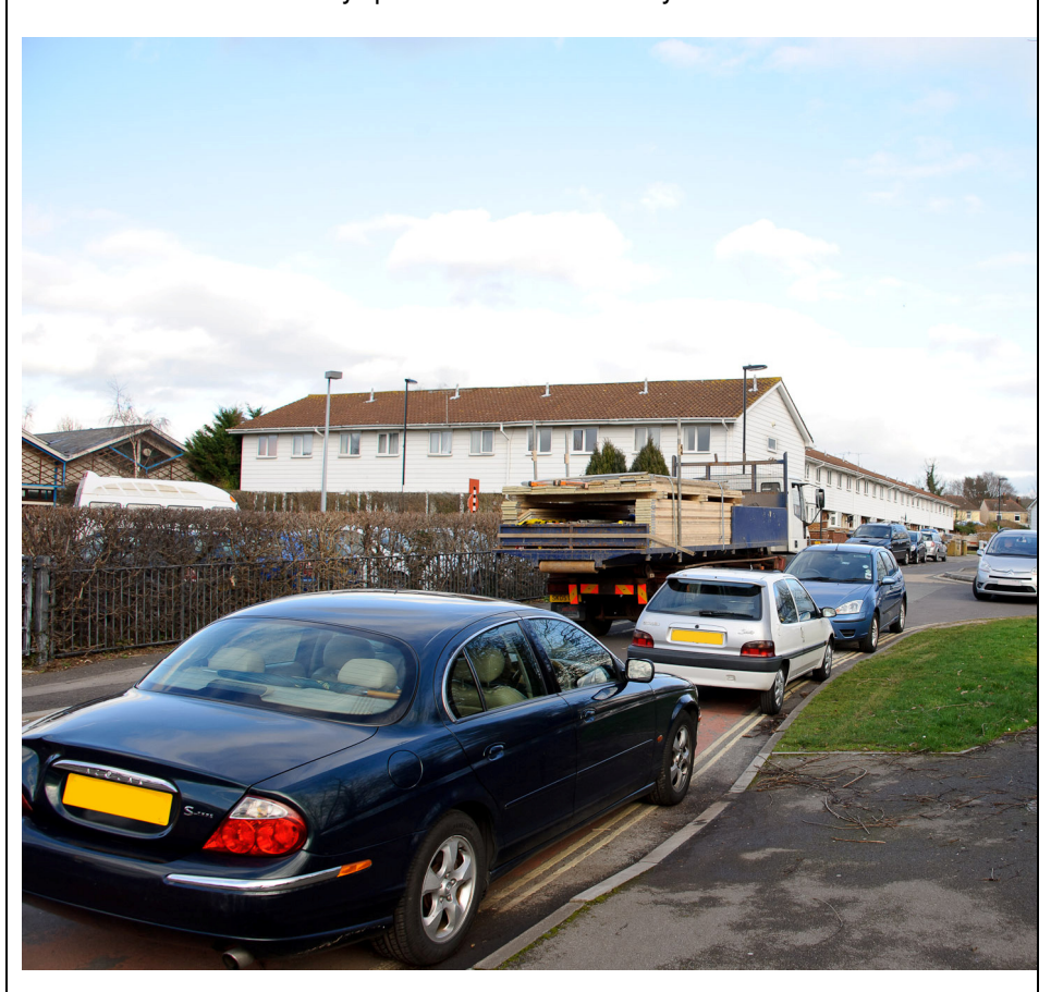
Figure 2. In the foreground cars are parked on double yellow lines restricting the remaining carriageway to single file only. The nearest car is completely blocking the only dropped kerb on this section of pavement which would cause considerable inconvenience to users of mobility scooters or wheelchairs. Beyond the verge on the right, two cars have parked in the turning area and a third car has double-parked alongside them. On the left, a goods vehicle is driving past the school gates further into the dead end section presumably hoping to find a convenient spot to turn around – the truck came back past 5 minutes later.

these illustrate a relatively quiet afternoon on Quayside Road.