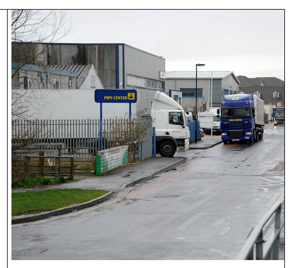
Figure 7. One Pipe Centre HGV waits whilst another manoeuvres in their gateway.