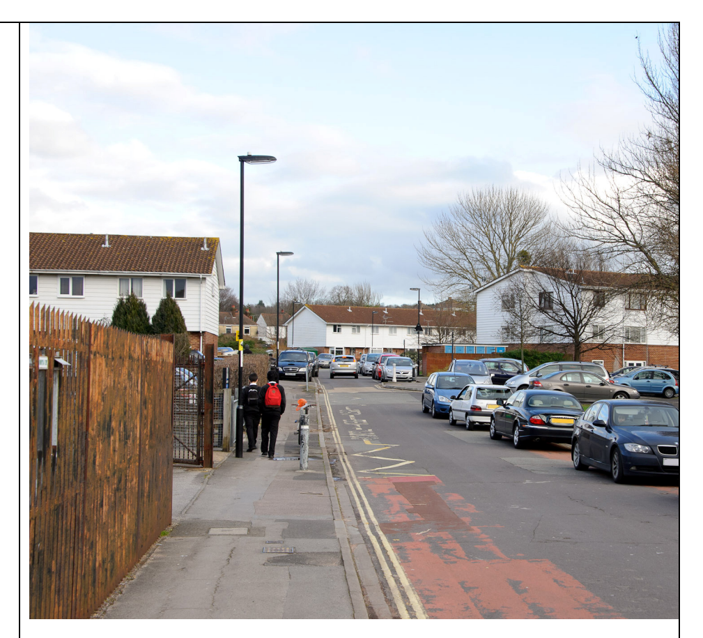
Figure 3. Plenty of cars parked on the south side of Quayside Road – there is insufficient space remaining on the carriageway for two cars to pass – this often leads to a gridlock with streams of traffic travelling towards each other in the single file areas unable to pass each other. The resolution often involves waiting several minutes until one side either reverses or drives up onto the pavement.